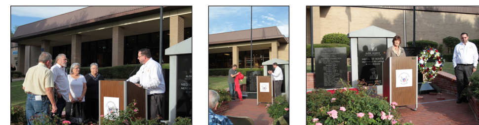
Five additional names have been awarded the Medal of Honor, Post War and their names are presented honorably on the new addition of the memorial.