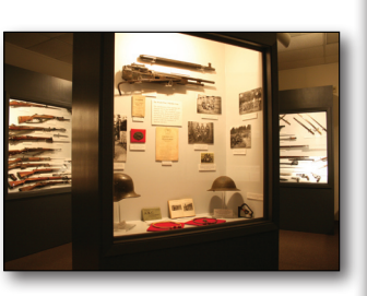
Newly Renovated Weapons Gallery

behind a protective plexiglass enclosure. The main focus of this gallery is World War