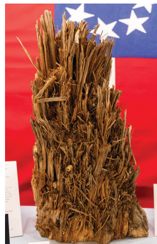
Witness Tree Stump

This witness tree stump most likely came from the Beachley Farm which was right in the middle of the Battle of South Mountain in Frederick County, Maryland. This stump is riddled with bullets on both sides from both the Confederate and Union armies. The cannonballs fired in this battle splintered this tree stump to shreds.