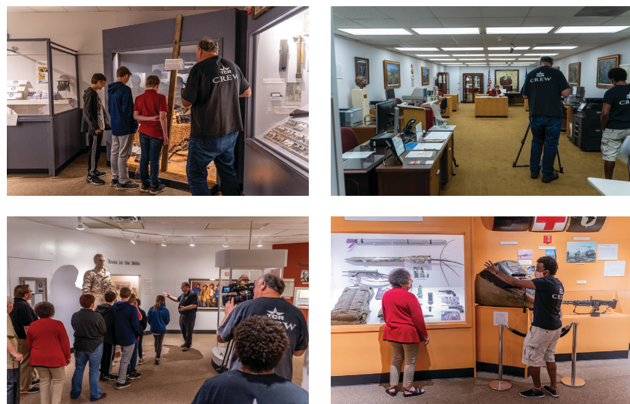
Community members and Hillsboro Junior High School students participating in the filming.