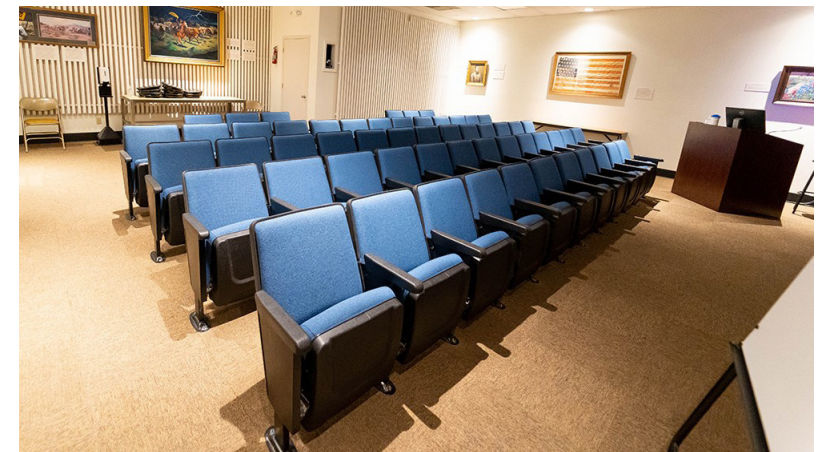
Above: Old Museum Theater Seating Below: New Museum Theater Seating