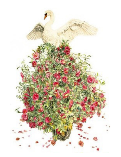
"Camellia and Swan" 42"x60" watercolor on Bristol by Steven Barker featured in the "Out of the Way Place" exhibit