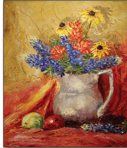
Bluebonnets & Pewter Pot