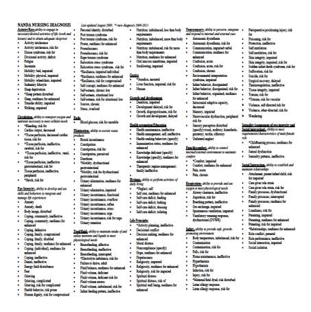
Figure 2 Older document includes good definitions of Nursing Diagnosis

Use the following link: <a href="http://fnm.tums.ac.ir/userfiles/education/en/pediatrics/Student/3.pdf">http://fnm.tums.ac.ir/userfiles/education/en/pediatrics/Student/3.pdf</a>