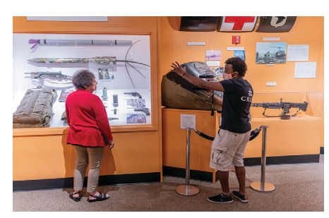
Community members and Hillsboro Junior High School students participating in the filming.