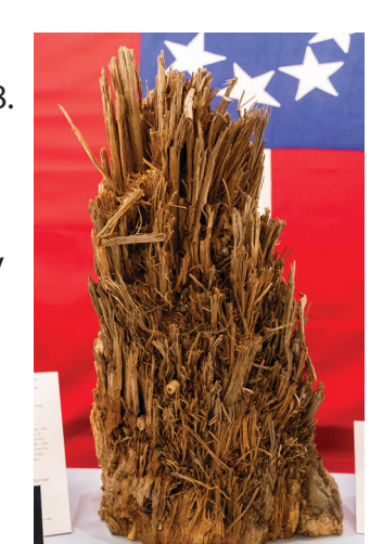
Witness Tree Stump

This witness tree stump most likely came from the Beachley Farm which was right in the middle of the Battle of South Mountain in Frederick County, Maryland. This stump is riddled with bullets on both sides from both the